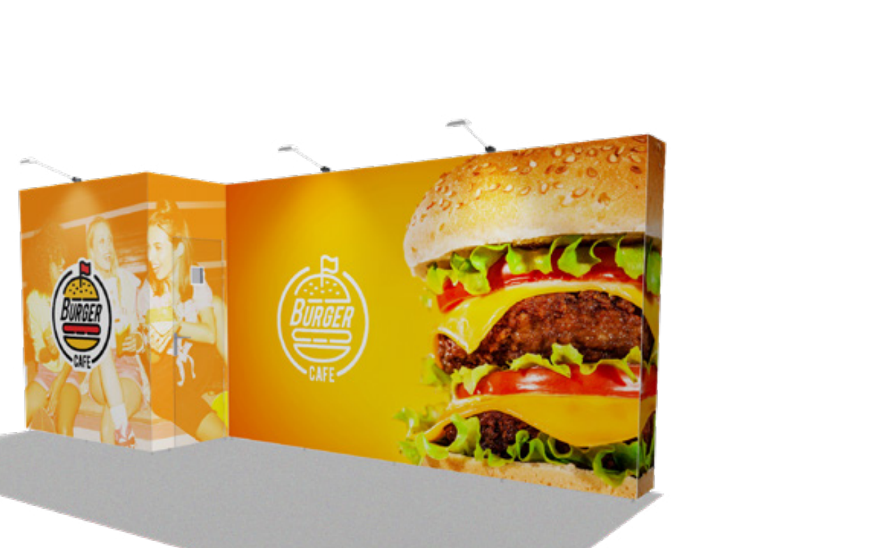
MEKONG 3 OPEN SIDES £325.00 excl. VAT