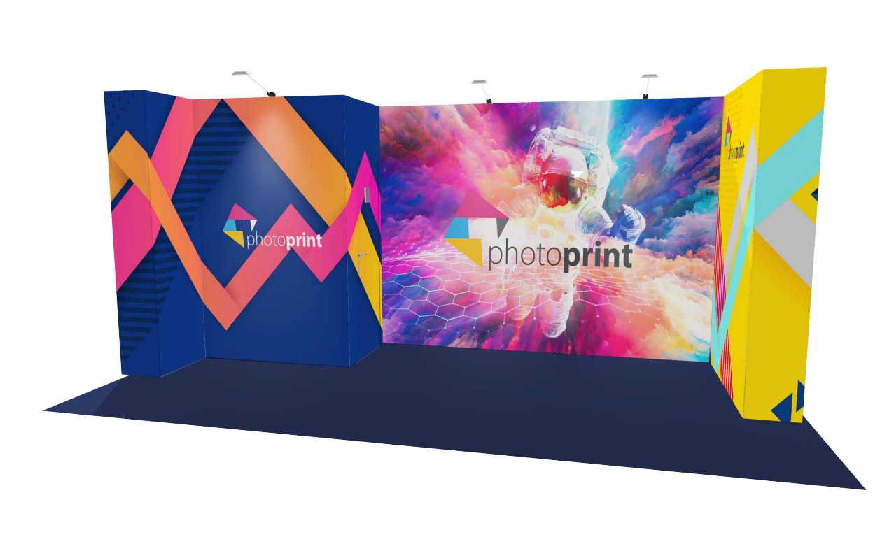
NILE 1 OPEN SIDE £325.00 excl. VAT