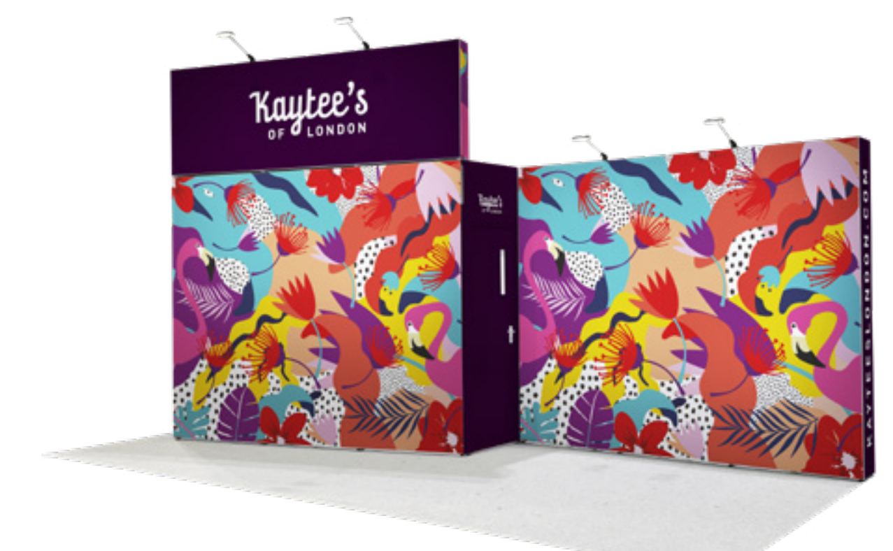
DANUBE 3 OPEN SIDES £325.00 excl. VAT