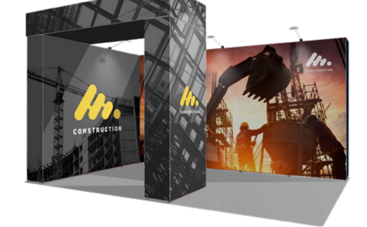
HUDSON 2 OPEN SIDES £325.00 excl. VAT