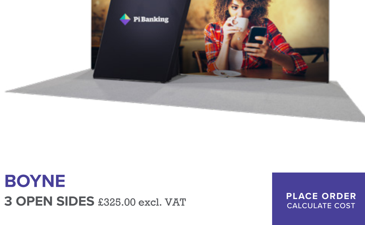
BOYNE 3 OPEN SIDES £325.00 excl. VAT