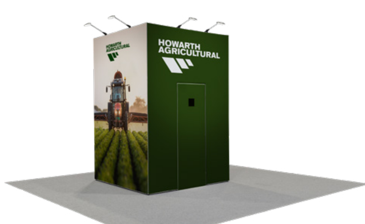
KLONDIKE (Min 5m x 5m) 4 OPEN SIDES £325.00 excl. VAT