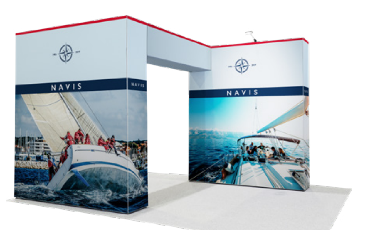
LOIRE (Min 5m x 5m) 4 OPEN SIDES £325.00 excl. VAT