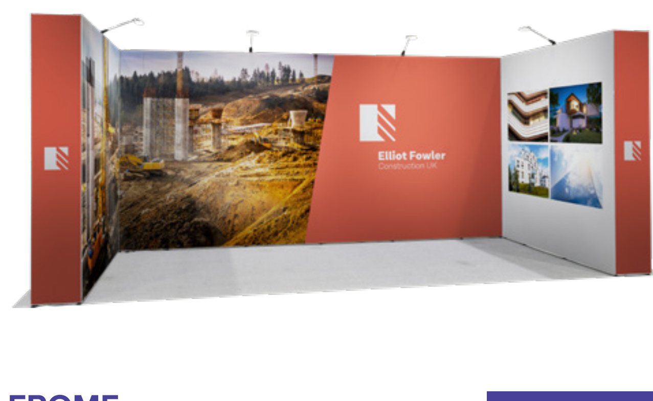
FROME 1 OPEN SIDE £325.00 excl. VAT