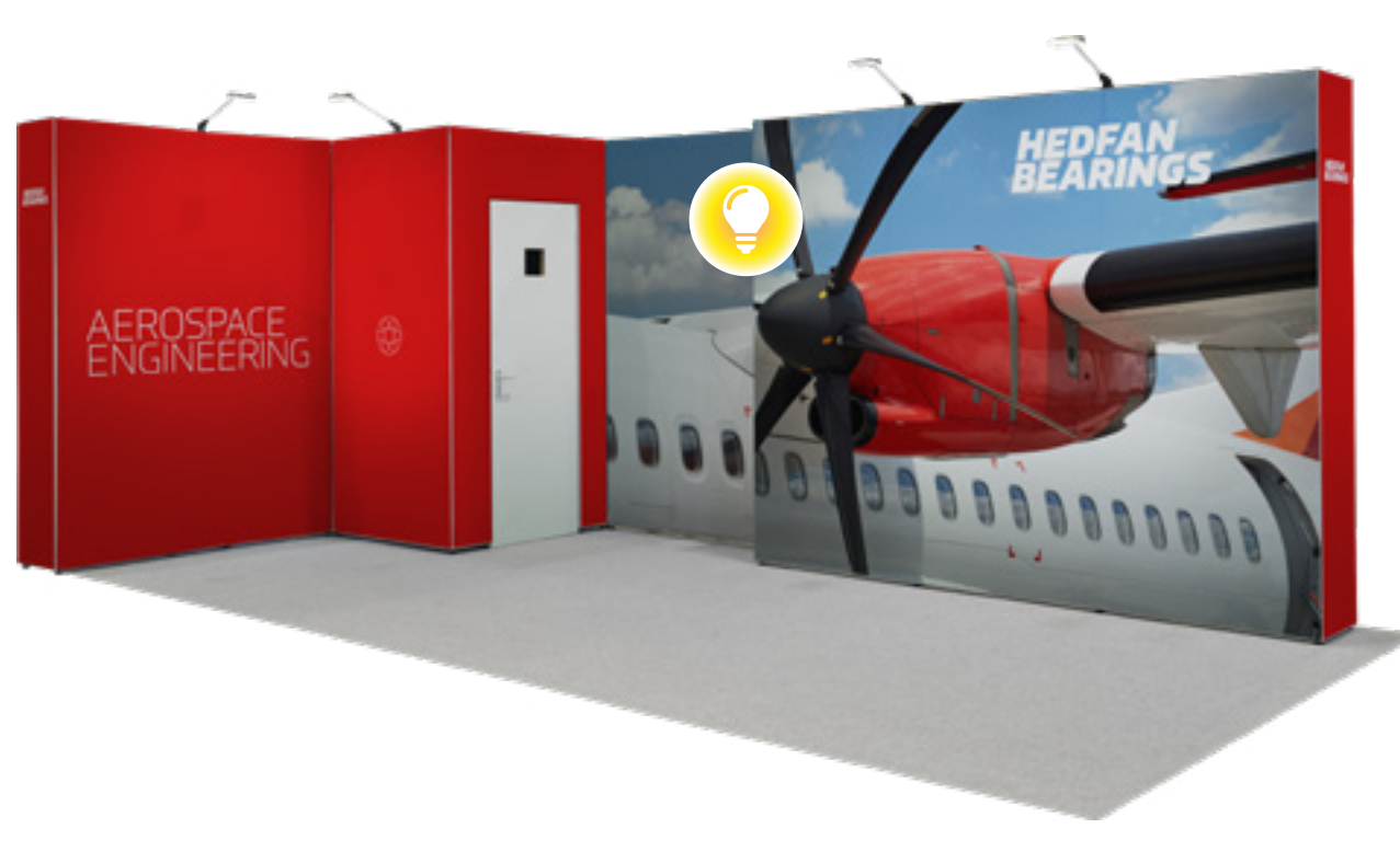
INARI (Light Box) 2 OPEN SIDES £325.00 excl. VAT