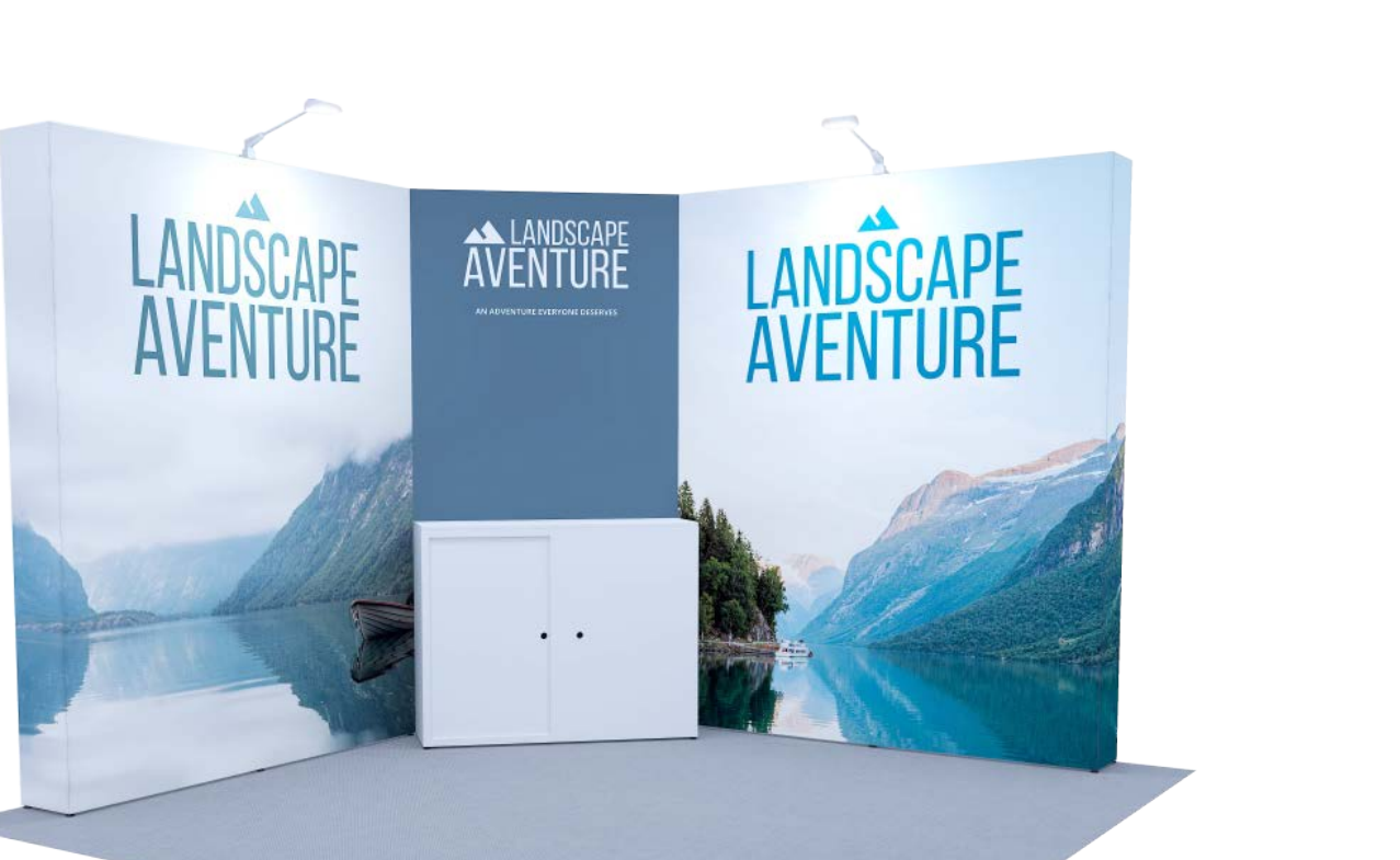
OHIO 2 OPEN SIDES £325.00 excl. VAT