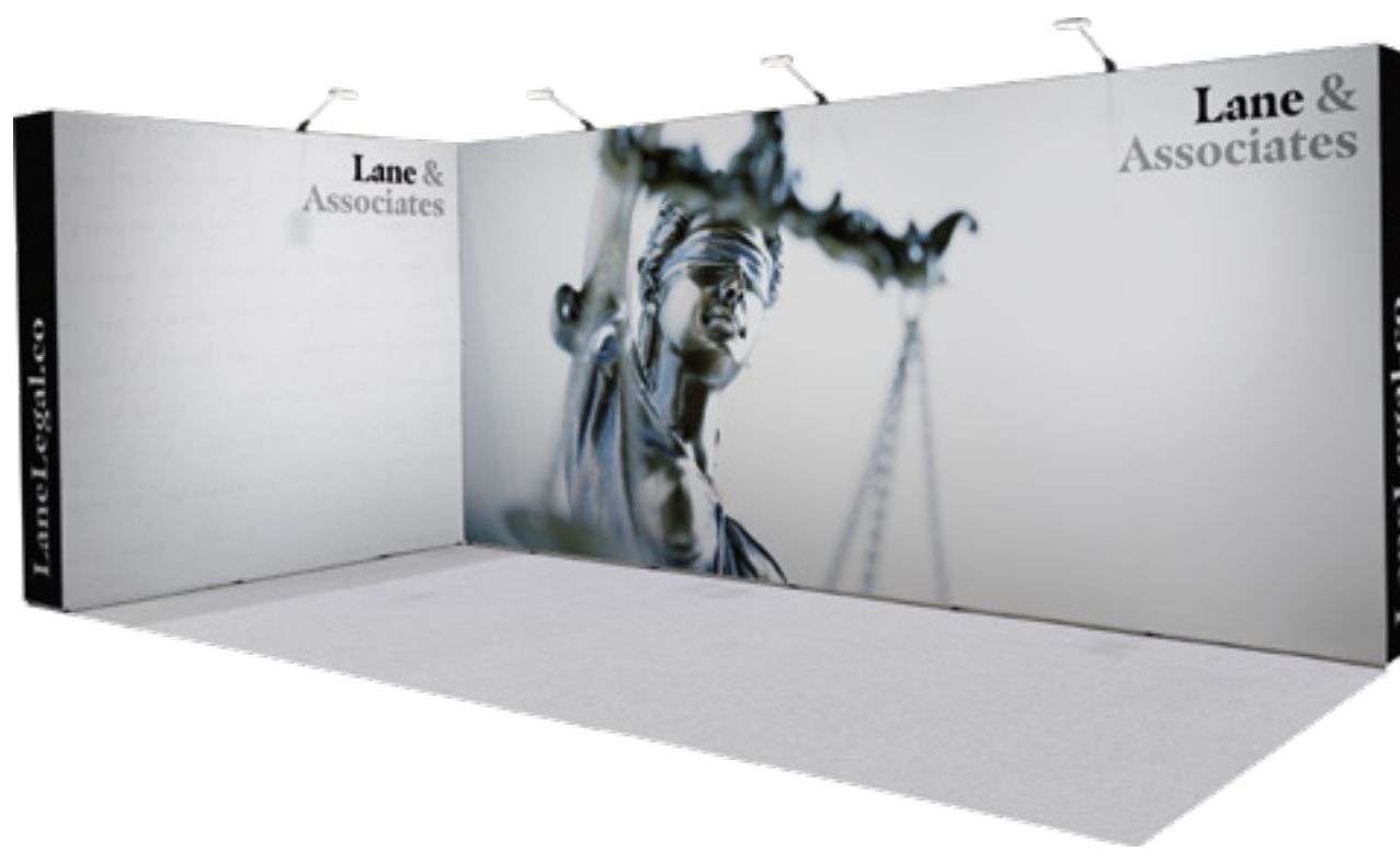
CLYDE 2 OPEN SIDES £325.00 excl. VAT