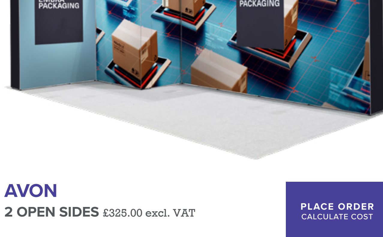
AVON 2 OPEN SIDES £325.00 excl. VAT