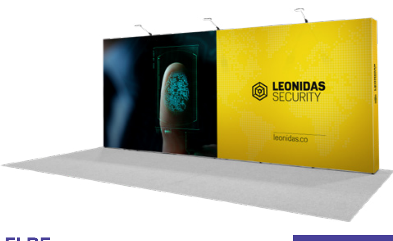
ELBE 3 OPEN SIDES £325.00 excl. VAT