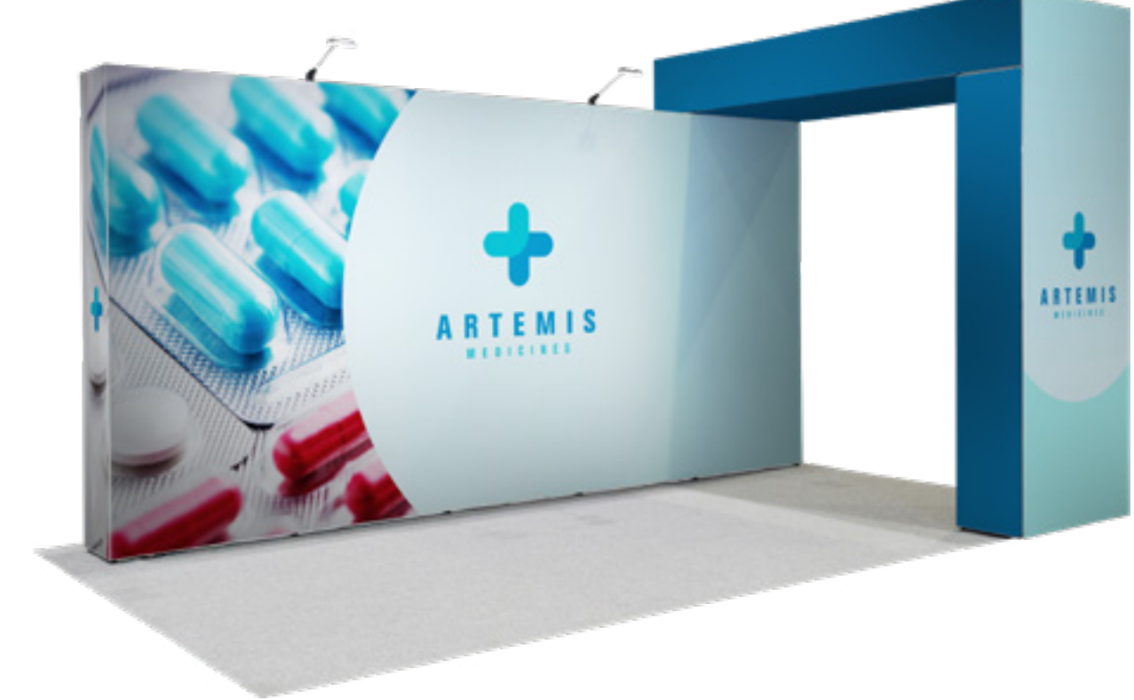
GARDA 3 OPEN SIDES £325.00 excl. VAT